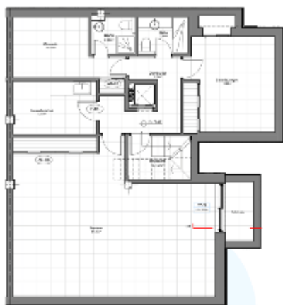
- BASEMENT -