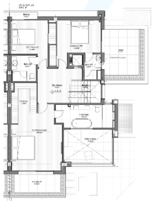
- FIRST FLOOR -