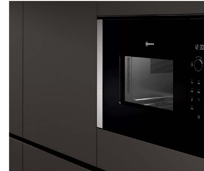
Non-contractual, non-binding advertising image.