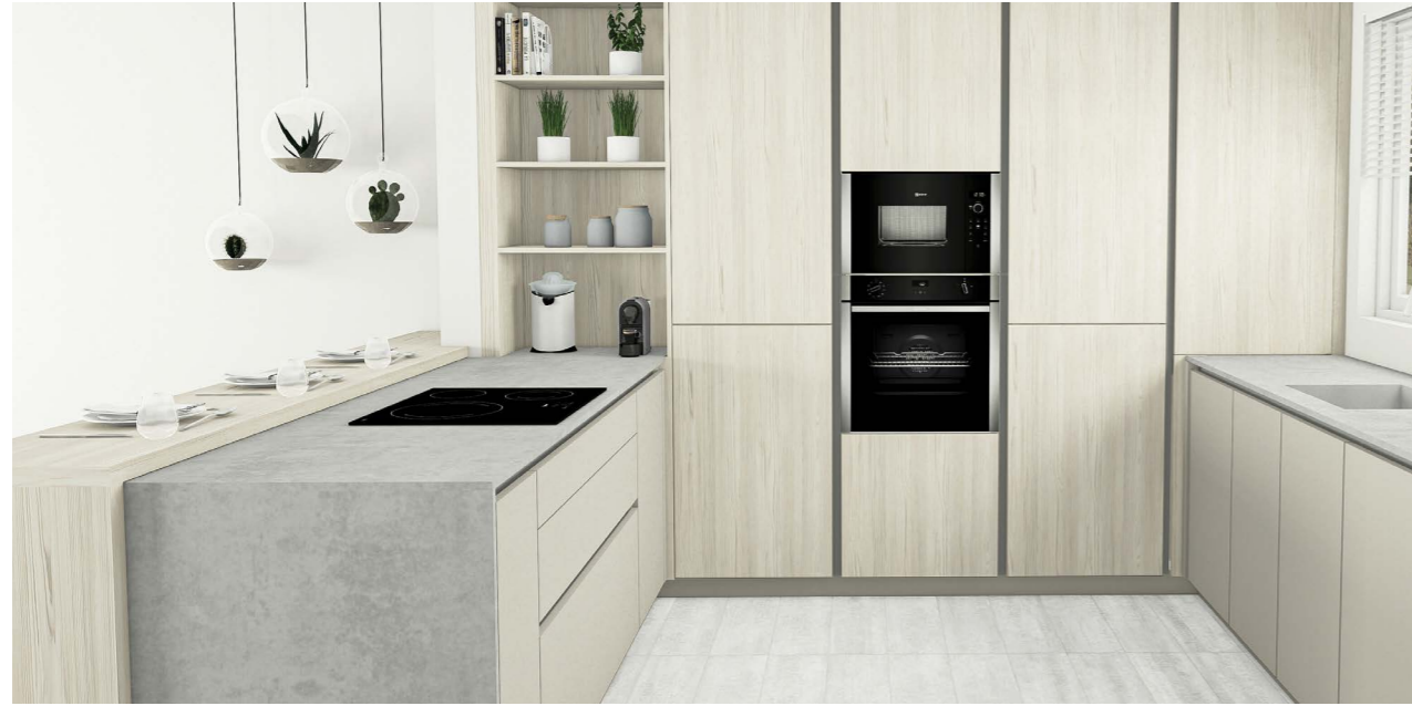
Non-contractual, non-binding advertising image.