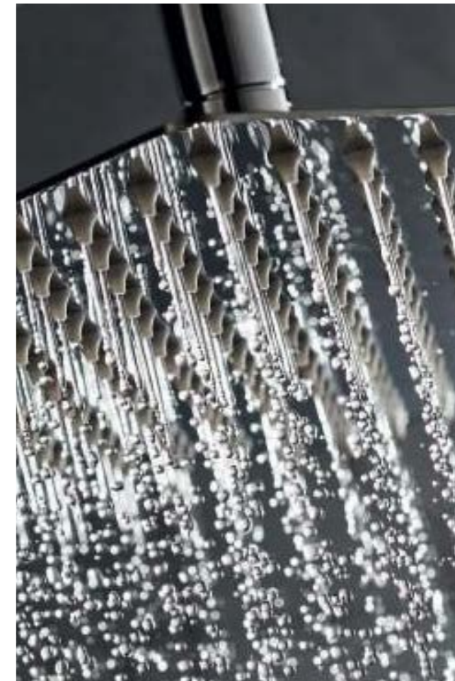
Non-contractual, non-binding advertising image.