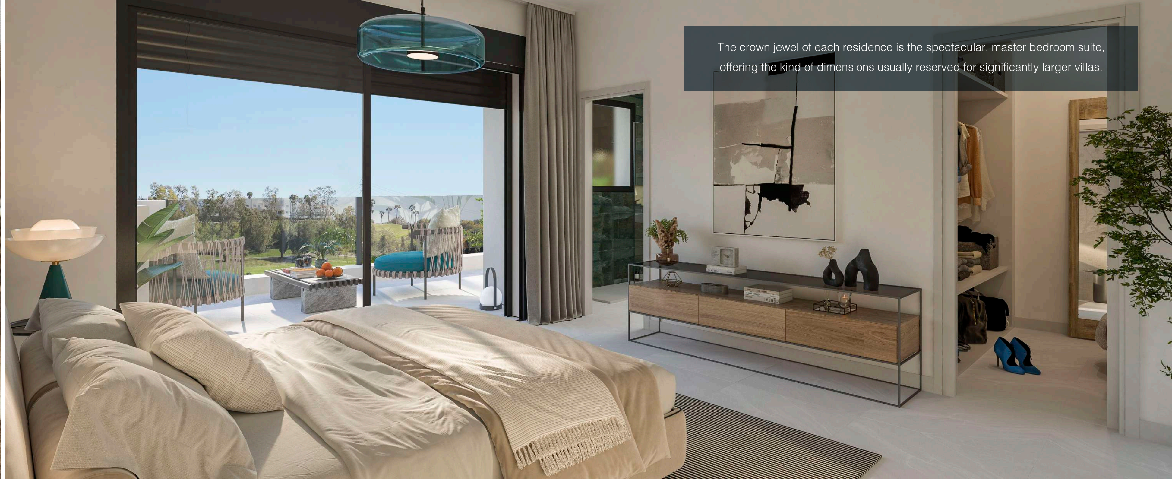
The crown jewel of each residence is the spectacular, master bedroom suite, offering the kind of dimensions usually reserved for significantly larger villas.